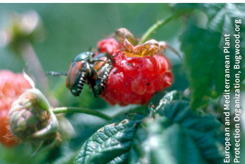
European and Mediterranean Plant Protection Organization, Bugwood.org