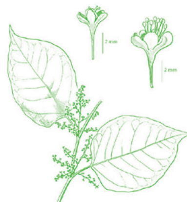
Japanese Knotweed

Stems: Green stems, or canes, are hollow with varying thicknesses, upright, and bamboo-like with reddish-brown/red speckles. Stems are generally 1-5 m in height and grow in large, dense thickets. Stems may persist through the winter as bare, grey or straw colored hollow stalks.