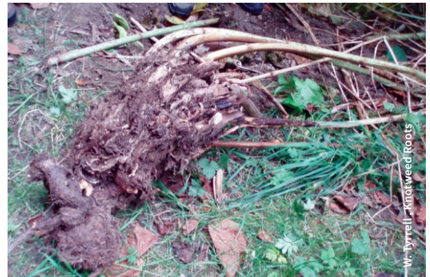
W. Pyrelli - Knotweed Roots

To move larger quantities of plants with soil attached from a regulated area, it must be taken to a landfill for deep burial. Contact the CFIA to obtain a movement certificate and contact a Vancouver Landfill for burial approval at least two days before your requested disposal date.