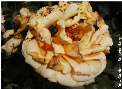
Dow Gardens, Bugwood.org