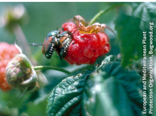
European and Mediterranean Plant Protection Organization, Bugwood.org