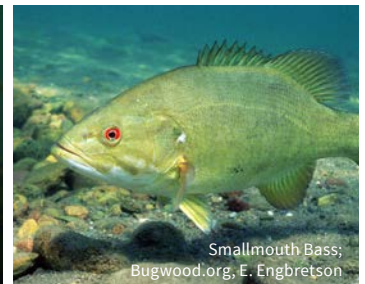
Smallmouth Bass

Current Distribution: Lower Mainland, Vancouver Island, Okanagan, Thompson, and Kootenay regions.