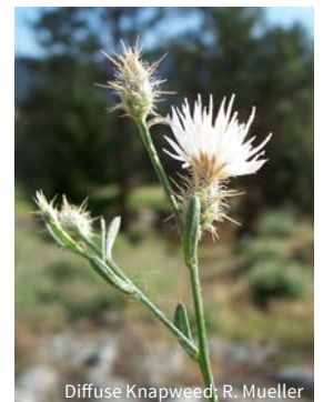
Diffuse Knapweed