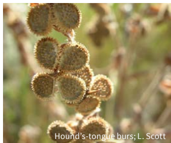
Hound's-tongue burs

Current Distribution: Cariboo, Thompson-Nicola, Okanagan-Similkameen and Kootenay regions.