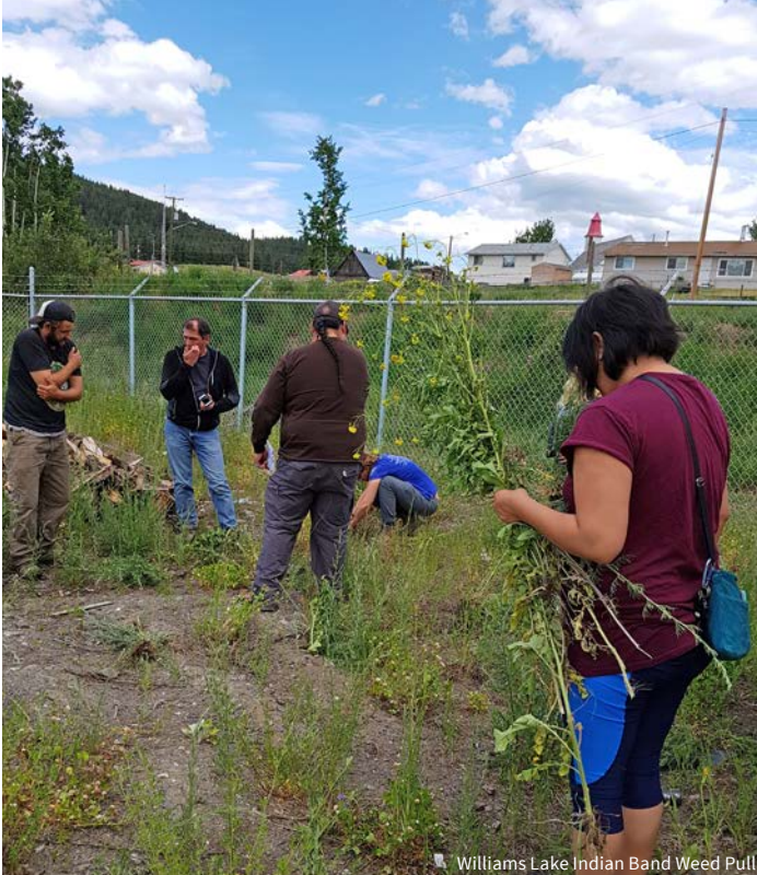
Williams Lake Indian Band Weed Pull