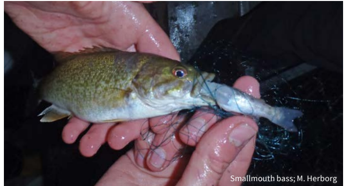
Smallmouth bass; M. Herborg

Invasive Species Council of British Columbia. (2014). Knapweeds. Retrieved from https://bcinvasives.ca/documents/Knapweed_TIPS_Final_08_06_2014.pdf