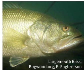
Largemouth Bass