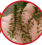
Brazilian elodea ( Egeria densa )