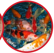
Koi carp ( Cyprinus rubrofuscus )

REPORT INVASIVE SPECIES: BCINVASIVES.CA/REPORT