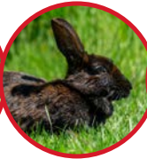
European rabbit ( Oryctolagus cuniculus )