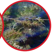
Eurasian watermilfoil ( Myriophyllum spicatum )