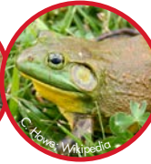
American bullfrog ( Lithobates catesbeianus )