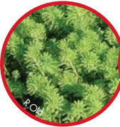
Parrot's feather ( Myriophyllum aquaticum )