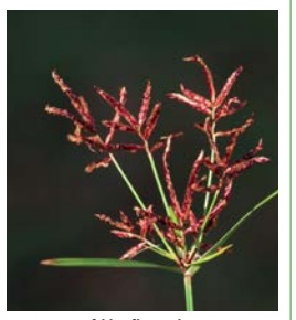
Leaf-like flower bracts are shorter than inflorescence