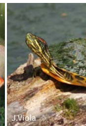
Red Eared Slider Turtle