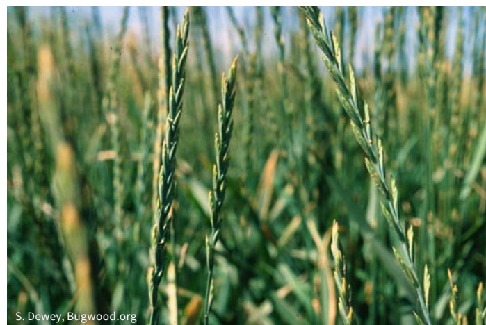
S. Dewey, Bugwood.org

Quackgrass: Very aggressive grass, spreads by rhizomes, out-competes forage and other crops.