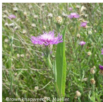
Brown knapweed; R. Mueller

Knapweed species: Chokes out desirable forage for livestock and wildlife and increases soil erosion.