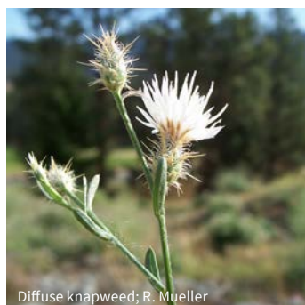
Diffuse knapweed