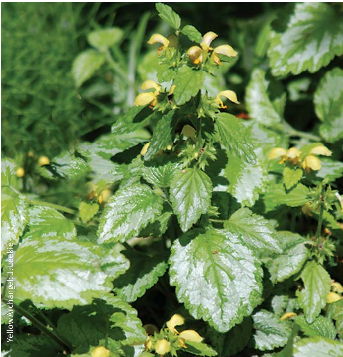
Yellow Archangel; J. Leekie