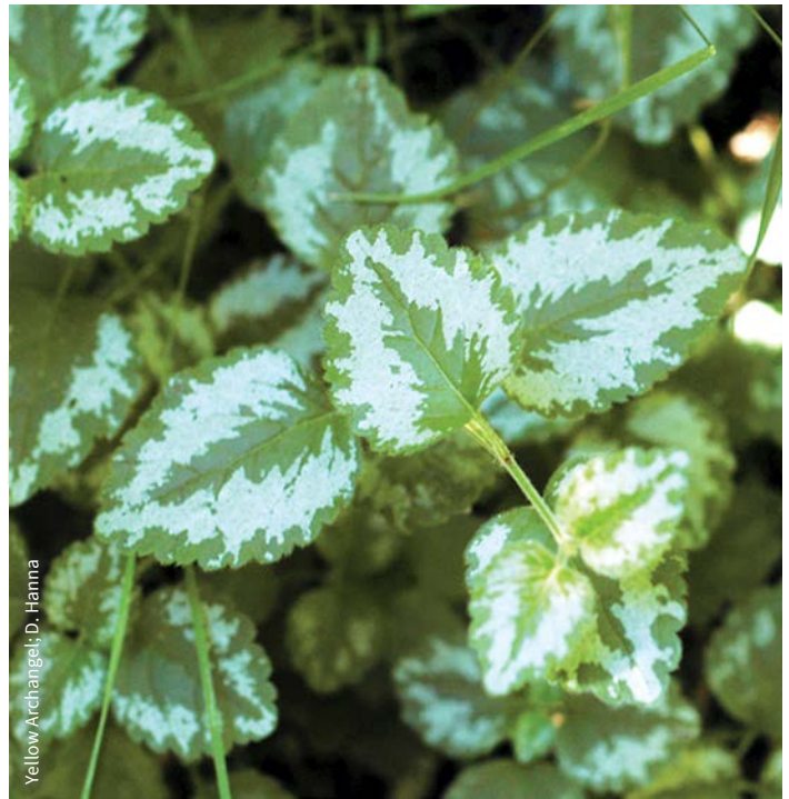
Yellow Archangel; D. Hanna

Application of herbicides on Crown land must be carried out following a confirmed Pest Management Plan ( Integrated Pest Management Act ) and under the supervision of a certified applicator. www.env.gov.bc.ca/epd/epdpa/ipmp/index.html