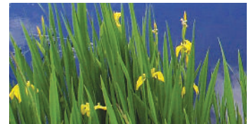
Yellow Flag Iris ( Iris pseudacorus )