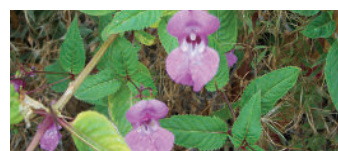
Policeman's Helmet ( Impatiens glandulifera )