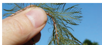
Eurasian Watermilfoil ( Myriophyllum spicatum )