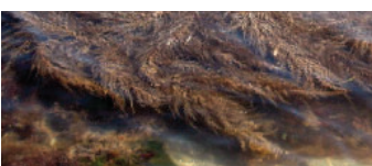
Japanese Wireweed ( Sargassum muticum )