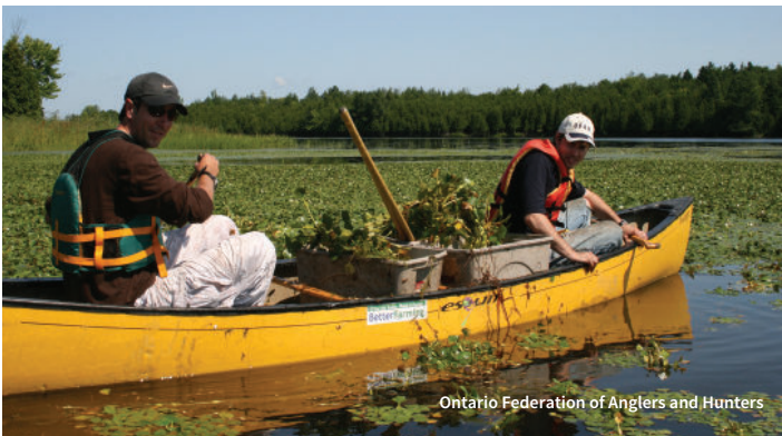
Ontario Federation of Anglers and Hunters

The term invasive plant, as used hereafter, includes provincially listed invasive plants and noxious weeds, as well as other alien plant species that have the potential to pose undesirable impacts on people, the economy, or the environment.