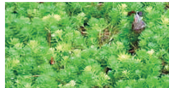
Parrot's feather ( Myriophyllum aquaticum )