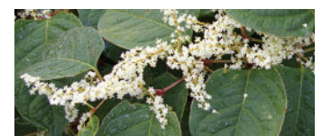
Knotweed ( Polygonum or Fallopia spp. )