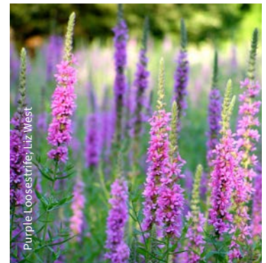
Purple Loosestrife, Liz West

Similar Non-Native Species: Sweet rocket or Dames violet ( Hesperis matronalis ) have alternate leaves with the lower leaves having short stalks (petiole). Flowers have 4 petals and develop long seed pods.