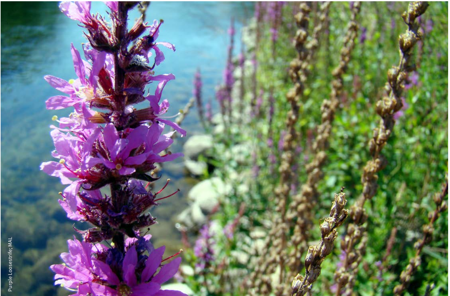
Purple Loosestrife, MAL