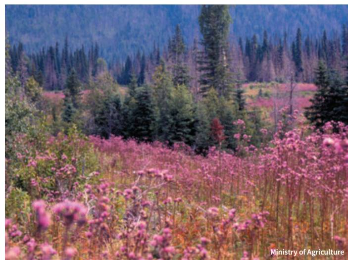
Ministry of Agriculture

A containment area has been established between Purden Lake and Valemount. Early detection and rapid response efforts should focus on locations outside of this containment area, which is mapped in the Invasive Alien Plant Program (IAPP) application.