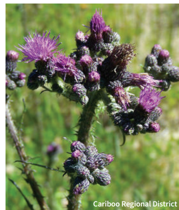
Cariboo Regional District

Similar Species: Distinguished from most other thistles by its single un-branched stem with spiny wings.