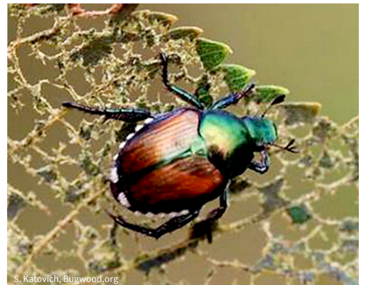
S. Katovich, Bugwood.org

All levels of government, businesses and local partners are working together to eliminate Japanese beetle from the Lower Mainland and Kamloops and prevent its spread into new areas.