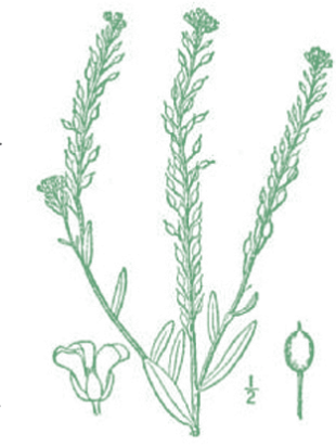
© The Illustrated Flora of BC

Dispersal: Seed is dispersed as a contaminant in hay and spread by vehicles, equipment, footwear, wildlife, and birds.