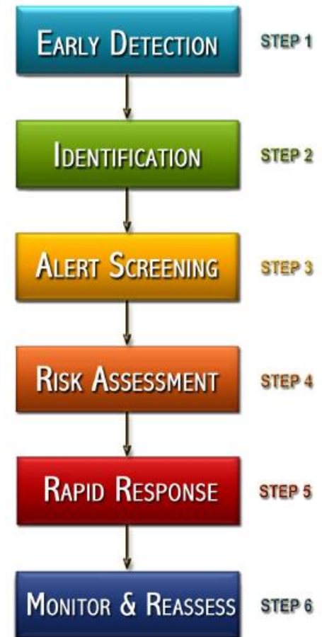
FIGURE 1: 6 STEPS OF THE BC EDRR PROCESS

http://www.for.gov.bc.ca/hra/invasive-species/edrr.htm