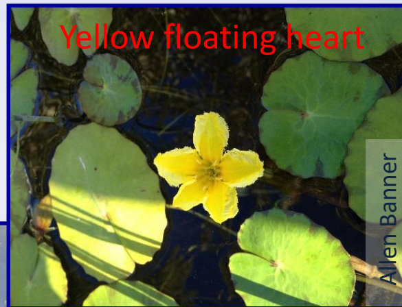
Yellow floating heart