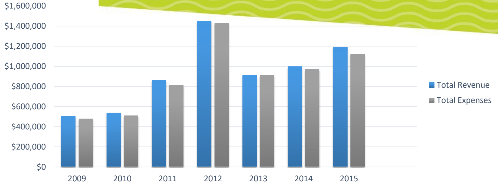
Special Project Revenue and Expenses 2009-2015