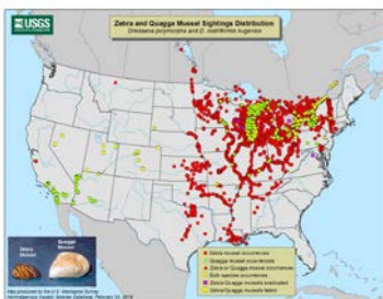
Zebra and Quagga Mussel Sightings Distribution U.S. Geological Survey (Feb 2018)

DO NOT attempt to clean the watercraft yourself!