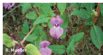
Policeman's Helmet ( Impatiens glandulifera )