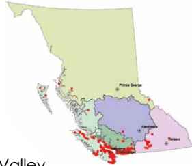
Distribution in BC (IAPP Aug. 2013)

Currently found in the central Fraser Valley, central to southern Vancouver Island, the Gulf Islands, and the east side of the Okanagan Valley between Kelowna and Penticton.