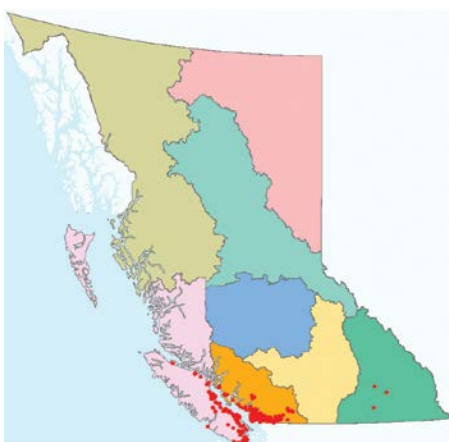
Giant Hogweed Distribution (2011)

Currently distributed in the Lower Mainland, Fraser Valley, Gulf Islands, and central to southern Vancouver Island.