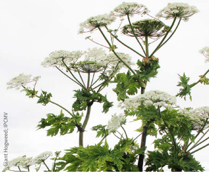
Giant Hogweed