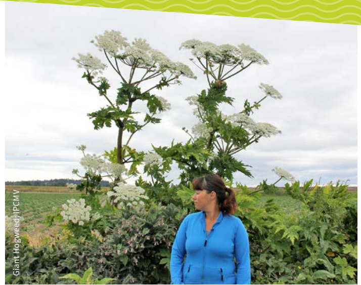
Giant Hogweed