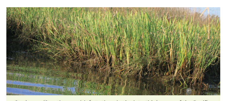
Cordgrass (Spartina spp.) infestations in the intertidal zones of the Pacific Northwest out-compete native species typically found in the intertidal region, such as eelgrasses, Dungeness crab, clams, juvenile salmonids and fish species, and migratory waterfowl. Cordgrass also traps sediment (up to 15 cm of new material annually), which changes the intertidal zone to salt marsh above Mean Ordinary High Water.

Salmon Habitat Limiting Factors Final report, Washington State Conservation Commission