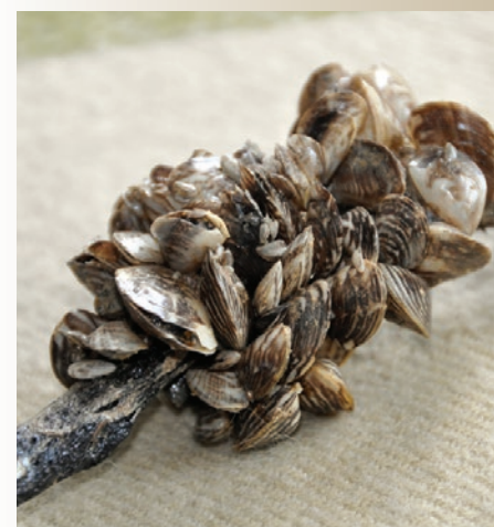
Zebra mussels ( Dreissena polymorpha ).