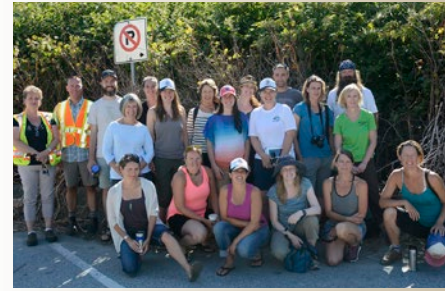
Regional Invasive Species Organizations.

Survey results indicate that the majority of respondents are using one or more behavior change programs, specifically: 38% of respondents use Clean, Drain, Dry; 46% use PlantWise 27% use Don't Let It Loose; 11% use Buy It Where You Burn It; and 24% use Play Clean Go. While 46% of respondents are not employing any behavior change programs. Behavior change programs such as these are continuing to grow in BC to support and foster responsible actions.