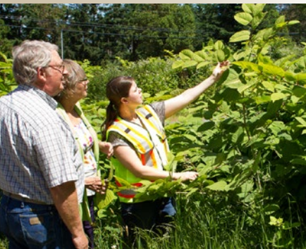
Japanese Knotweed ( Fallopia japonica ).

Survey results indicate that 60% of respondents monitor for compliance with enforcement actions.