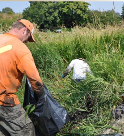
Invasive plant removal.