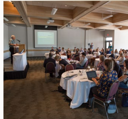
2017 Invasive Species Research Conference.

Overall, organizations and individuals within British Columbia are working to address common issues and challenges relating to invasive species, as is clearly evidenced within the MFS Framework and Provincial Survey. There are still many opportunities for collaboration, increased coordination and improved public understanding, however great strides have and will continue to be made in the management of invasive species.