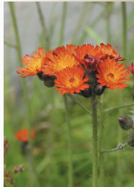
Orange Hawkweed ( Hieracium aurantiacum ).