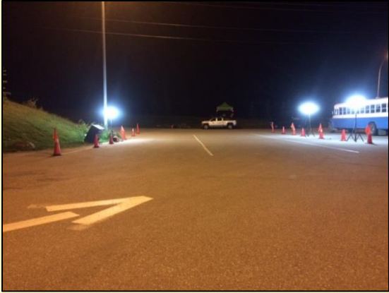
Nighttime operations at the Golden inspection station.