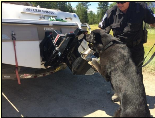
Kilo the mussel detection dog is now touring inspection stations.