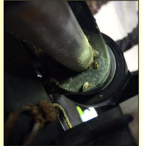
Invasive mussels found on a watercraft intercepted at the Golden station coming from Ontario.

On Friday June 30, a vehicle towing a trailered watercraft from Quebec failed to stop at the Golden inspection station. Sgt. Josh Lockwood of the COS/AIS K9 UNIT apprehended the vehicle and escorted it back to the inspection station. During the K9 inspection, Kilo detected mussels in several locations and Inspectors visually confirmed the presence of invasive mussels. The watercraft was decontaminated, and sealed with a 30-day quarantine period. The owner of the watercraft received a ticket for failing to stop at the inspection station and a ticket for possession of Dreissenid mussels. The watercraft had previously been in infested waters in Quebec one week prior and was destined for Shuswap Lake, BC.