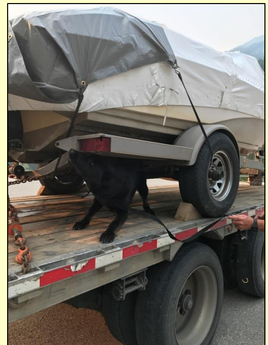
Kilo inspecting a commercially hauled watercraft from Ontario at the Golden inspection station.